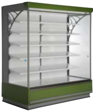
SPIRIT MD Front height 300, 430 mm Depth 1010, 1110, 1210 mm MDFV 1110, 1210 mm Height 2000, 2200 mm Length 1250, 1875, 2500, 3750 mm