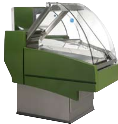
GUSTO SO Front height 580 mm Depth 1160 mm Height 880, 1180 mm Length 1250, 1875, 2500, 3750 mm

Options for Gusto end wall and front panel • Painted plate • Stainless steel • Wood, painted MDF