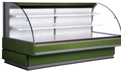
INSPI SV Front height 300, 430, 580 mm Depth 1010, 1170, 1210, mm Height 1180, 1500 mm Length 1250, 1875, 2500, 3750 mm