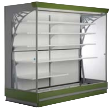
INTRO RI Front height 300, 430 mm Depth 1110, 1210 mm RIFV 1110, 1210 mm Height 2000, 2200 mm Length 1875, 2500, 3750 mm