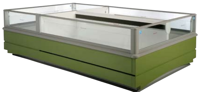
MAXIM FI, CI Height 900, 990 mm Depth 1100, 1500, 1900, 2300 mm Length 1875, 2500, 3750 mm