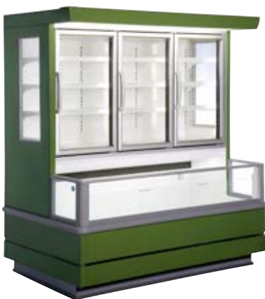
NARDO HGD Height 2000, 2200 mm Depth 1219 mm Length 1875, 2500, 3750 mm

Options for Gusto end wall and front panel • Painted plate • Stainless steel • Wood, painted MDF