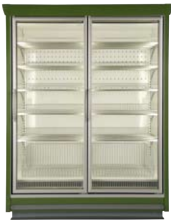
Luxo FGD Height 2000, 2200 mm Depth 969 mm Length 795, 1565, 2345, 3125, 3890 mm No of doors 1-5 kpl