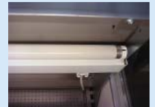
Standard shelf lighting.