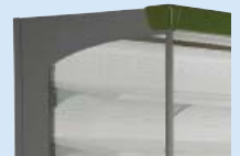
Standard cover plate.